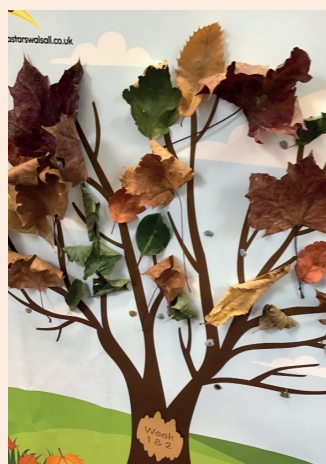
Palfrey Junior School

In October, our A*STARS schools took part in Move More Month, an initiative designed to encourage children and their families to adopt more active and sustainable journeys to school. Throughout the month, pupils were encouraged to walk, cycle, scoot, or use park and stride as their primary mode of travel. This year's campaign included a class-based challenge, where pupils collected a leaf for each day they travelled actively to school. These leaves were added to a provided tree trunk, resulting in a "forest" display that visually showcased each school's collective participation and commitment to active travel.