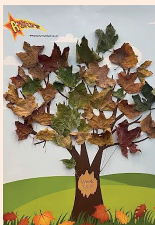
Christ Church School