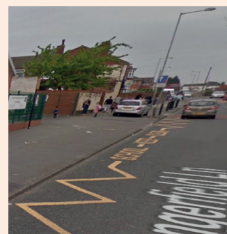
Before and after our SRTS scheme at Rowley View Nursery.